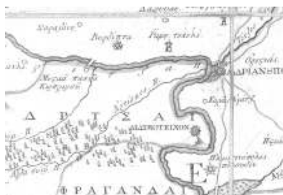
Kapesovo variant of Version-A, sheet No. 9: toponym “Αρτίσκος Π.”.