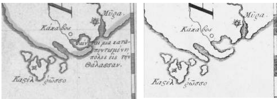
Kapesovo variant of Versio-A , sheet No. 3: text “Φαίνεται μία καταποντισμένη πόλις εις την Θάλασσαν.” Versio-A , sheet No. 3: text missing.