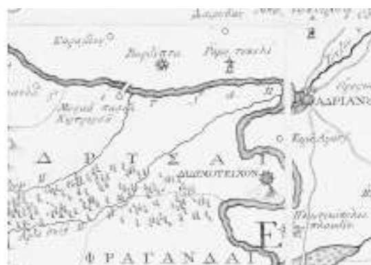
Version-A, sheet No. 9: toponym missing.